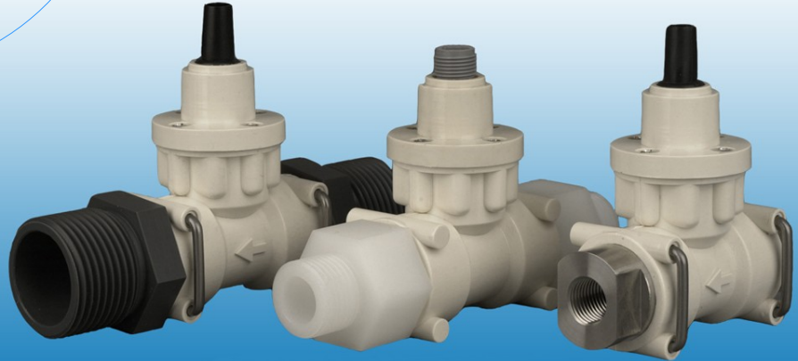
FT2 Flowmeter various fitting options

Opaque fluids OEM use Water treatment Cooling equipment Active flow alarms Semiconductor plant Engine test